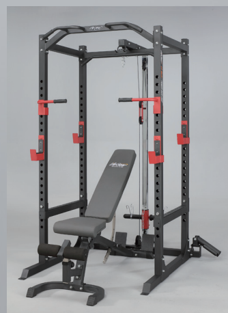
The Power Rack Can Be Combined With Body Bench (Not Included) & Barbell (Not Included) To Including The Big 6 Exercise In Your Routine Training With Extra Safety, Such As: Bench Press, Deadlift, Barbell Row, Barbell Squat, Shoulder Press And Etc.