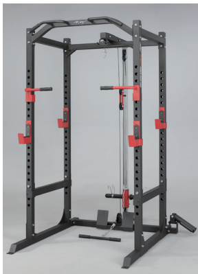
The Lat Pulldown / Low Row Attachment Is An Attachment For Power Cage #78220 (Not Included) That Allows You To Workouts Such As Lat Pulldowns, Tricep Pushdowns, Low Rows, And Overhead Cable Curls