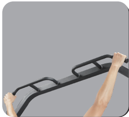
Multi-Position Over Head Chin Up/Pull Up Grip Bars For Building Your Arm, Shoulder And Back Muscle Groups With Variety Of Exercises.