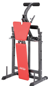
Folds for storage