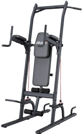
Fold for Storage