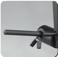
Standard Plate Post with Spring Collar