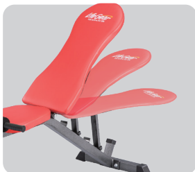
( 5-Level Incline of Back Pad )