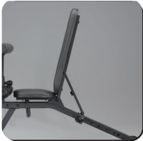
6 Adjustable Backrest Angles