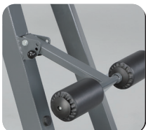
The Adjustable Knee Lock-Down To Lock You In Place For Lat Pulldowns.