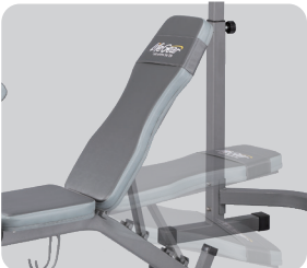
( 5-Level Incline of Back Pad )