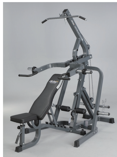
The Body Bench Can Be Combined With Leverage Gym (Not Included), And These Handles Can Also Be Used For Your Big Press Movements, Including Chest Press And Shoulder Press.