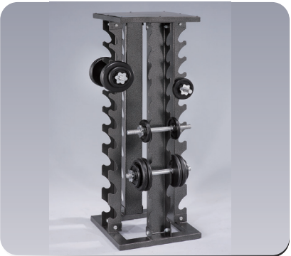
(Easy Access and Storage of Dumbbells)