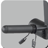
Olympic Adapter Sleeve Allows You To Use Olympic Plates