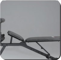
5 Adjustable Seat Heights