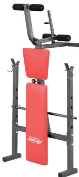
Folds for storage