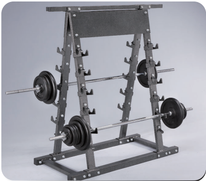
(Easy Access and Storage of Barbells)