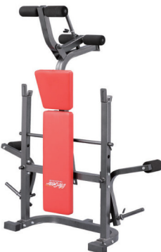
Folds for storage