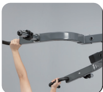
The Press / Squat Arm Can Be Used With Single Arm Exercises By Removing The Arm Lock Pin.