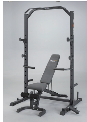
The Weight Bench Can Be Combined With Power Rack (Not Included) & Barbell (Not Included) To Including The Big 6 Exercise In Your Routine Training With Extra Safety, Such As: Bench Press, Deadlift, Barbell Row, Barbell Squat, Shoulder Press And Etc.