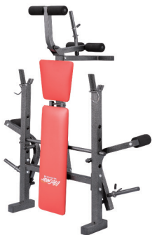
Folds for storage