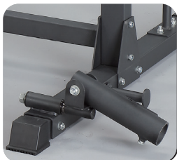
The Landmine Attachment Allows You To Use Your Barbell For Various Exercises That Targets Muscles In Your Back, Shoulder, Abdominals, Triceps, Biceps, Legs, And More.