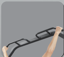
Multi-Position Over Head Chin Up/Pull Up Grip Bars For Building Your Arm, Shoulder And Back Muscle Groups With Variety Of Exercises.