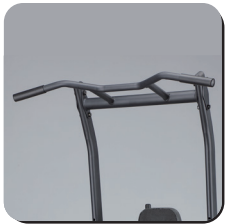
Regular & Wide Pull-Up Bar