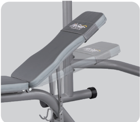
( 4-Level Incline of Back Pad )