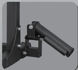
The Landmine Attachment Allows You To Use Your Barbell For Various Exercises That Targets Muscles In Your Back, Shoulder, Abdominals, Triceps, Biceps, Legs, And More.