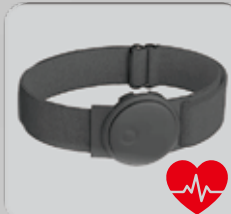
This Wireless Heart Rate Monitor Armband Can Track Your Heart Rate By Connecting It Via Wireless To Your Treadmill.