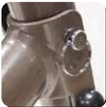
Frame is Held Securely by Lock Pin