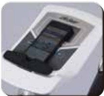
Innovative Computer Console Shape with Mobile Device Holder