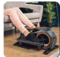
The Small Compact Style Allows You To Exercise While In A Seated Position