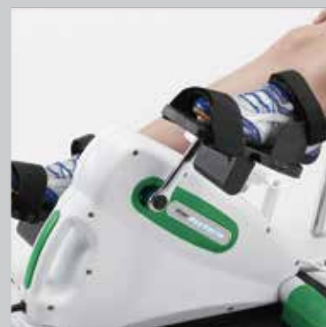
• Leg Exercises