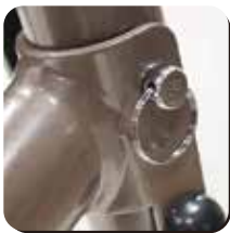
Frame is Held Securely by Lock Pin