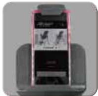
Innovative Computer Console Shape with Mobile Device Holder