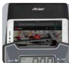
Innovative Computer Console Shape with Mobile Device Holder