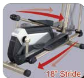
Additional 18" Stride Length Compares to Similar Spec Competitor