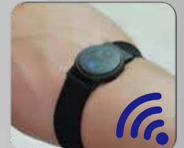
Easy To Use The Wireless Heart Rate Monitor Armband, Simply Power It On And It Will Automatically Connect With The Treadmill Via Wireless.