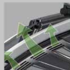
Stylish Air Outtake Blows Wind For Exercise Comfort.