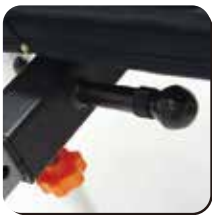
Adjustable Boom is Held Securely by Both Two Knobs