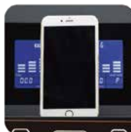
Innovative Computer Console Shape with Mobile Device Holder