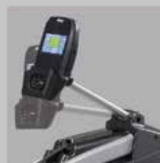
Monitor Angle and Height Can Be Adjusted In a Wide Range With an Elegant Mechanism.