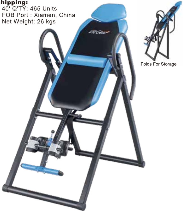
Folds For Storage