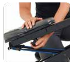
The Adjustable Seat Cushion Can Be Adjusted Freely Back And Forth Direction To Your Desired Seated Position.