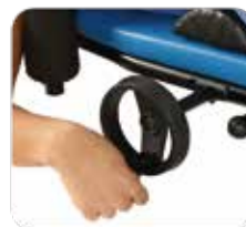
Stretch Your Back By Turning The Manual Control Wheel With Flip Out Handle For Comfortable And Smooth Decompression.