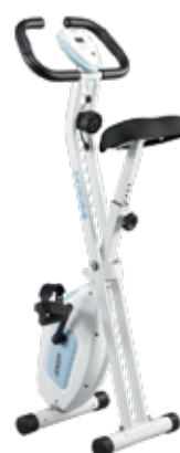
Folds for Storage