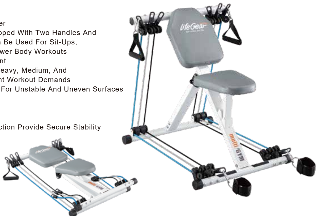
Folds for Storage