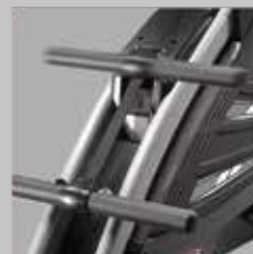
Handlebar Can Be Placed on Two Positions.