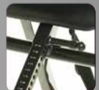
Adjustable Boom is Held By Spring Knob