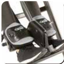
Option: The AIRSOFT Ankle Holders Is An Optional Accessory