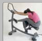
Hips, Legs, Back