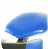
Adjustable Headrest for Head Comfort While Inverting