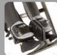
Safety Ankle Locking System to Lock your Ankles Securely and Comfortably