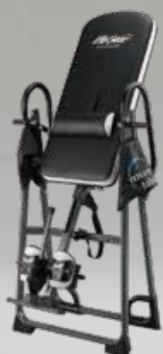
Folds for storage