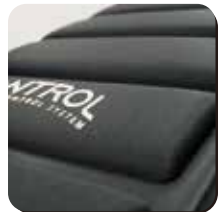
Foam Backrest with Curvy Wave Foam Provides for Extra Comfort