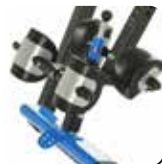
Triple Safety Ankle Locking System" to Lock your Ankles Securely and Comfortably