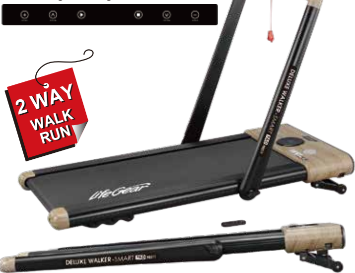
15-Level Power Incline