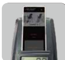
Innovative Computer Console Shape with Mobile Device Holder