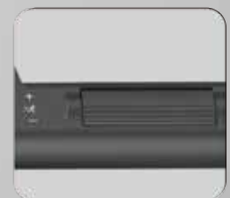
Use The Scroll Wheels To Easily Adjust The Speed And Incline During Your Workout.