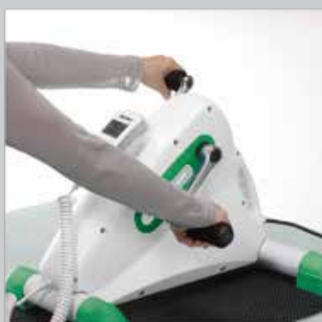
• Arm Exercises