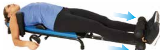
The Back Stretch Traction Table Helps Improve Your Posture And Reduce Back Pain By Decompressing Your Back, Shoulders, Hips, Knees, And Spine. Simply Turn The Manual Control Wheel With The Flip Out Handle.