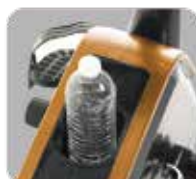
Water Bottle Holder Included