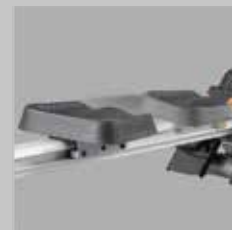
Ultra Smooth Rowing Experience Created By Aluminum Track With Rollers.