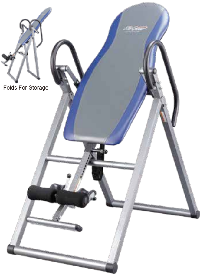
Folds For Storage