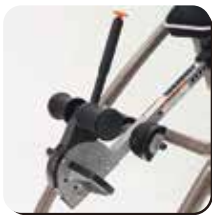
"Quick Release Ankle Lock System" Handle to Lock Your Feet Securely