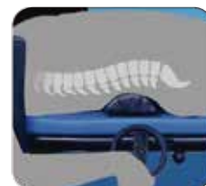
The Soft Foam Backrest With A Removable Lumbar Pillow Provides Comfortable Lower Back Support While On Traction.