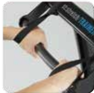
Handlebar Straps Provide An Improved Security And Control.