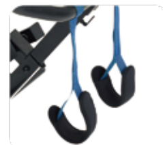
Two Safety Straps Located On The Handlebars Will Help Ensure The Safe Operation Of The Machine.