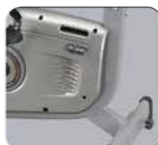
High Quality Main Frame Which is Molded in One Body with Curve Shape Design