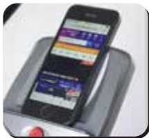
ITEM # 93250N