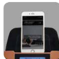
Innovative Computer Console Shape with Mobile Device Holder