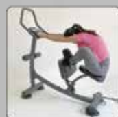
Inner Thighs, Groin