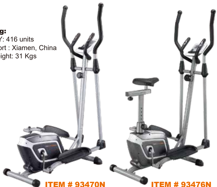
ITEM # 93470N