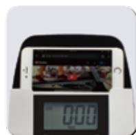
Innovative Computer Console Shape with Mobile Device Holder