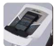
Innovative Computer Console Shape with Mobile Device Holder