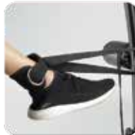
Tighten The Ankle Straps Securely To Avoid Falling From The Stretch Trainer While Doing Leg Stretch.