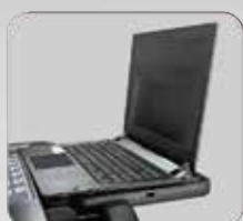
The Console Can Be Folded Horizontally, You Can Place A Laptop On It.