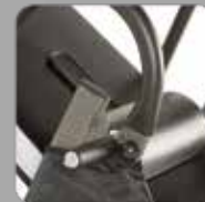
Removable Lumbar Pillow Provides Comfortable