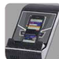
Innovative Computer Console Shape with Mobile Device Holder