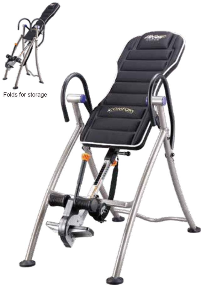
Folds for storage