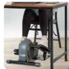
This Mini Magnetic Elliptical Cycle Can Be Used Under-Desk For Leg Exercise