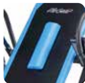
Removable Lumbar Pillow Provides Comfortable