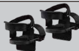
• Non-Skid Foot Pedals