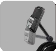
Monitor Can Be Adjusted To The Most Comfortable Viewing Angle For Users Of Different Heights.