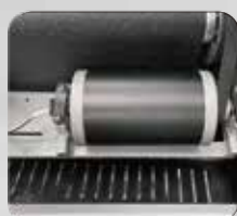
BLDC Motor Have Less Friction and Inertia While Working, Resulting Smaller Noise Compare to Traditional DC Motor