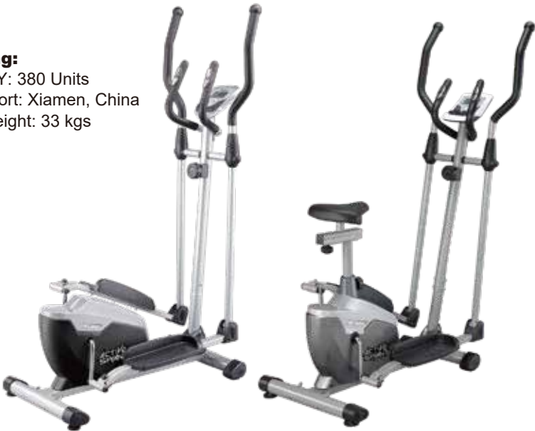
ITEM # 93460N