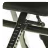
Adjustable Boom is Held By Spring Knob