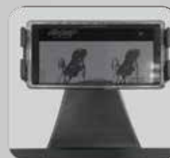
Built-in 360° Mobile Device Holder.