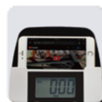
Innovative Computer Console Shape with Mobile Device Holder