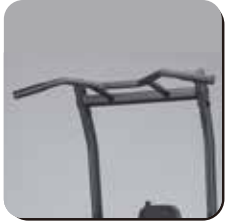
Regular & Wide Pull-Up Bar