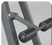
The Adjustable Knee Lock-Down To Lock You In Place For Lat Pulldowns.