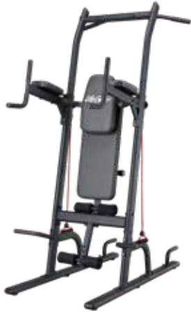
Fold for Storage