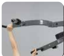
The Press / Squat Arm Can Be Used With Single Arm Exercises By Removing The Arm Lock Pin.