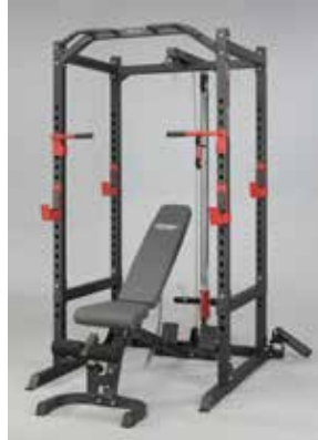
The Body Bench Can Be Combined With Power Rack (Not Included) & Barbell (Not Included) To Including The Big 6 Exercise In Your Routine Training With Extra Safety, Such As: Bench Press, Deadlift, Barbell Row, Barbell Squat, Shoulder Press And Etc.