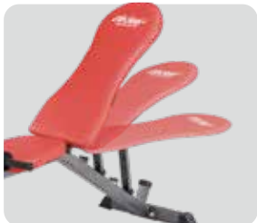
( 5-Level Incline of Back Pad )