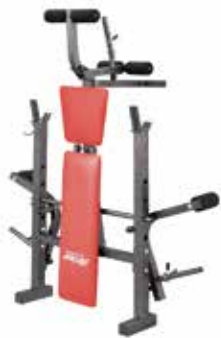
Folds for storage