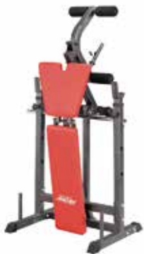
Folds for storage