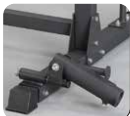
The Landmine Attachment Allows You To Use Your Barbell For Various Exercises That Targets Muscles In Your Back, Shoulder, Abdominals, Triceps, Biceps, Legs, And More.