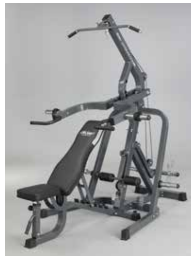
The Body Bench Can Be Combined With Leverage Gym (Not Included), And These Handles Can Also Be Used For Your Big Press Movements, Including Chest Press And Shoulder Press.