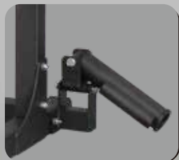
The Landmine Attachment Allows You To Use Your Barbell For Various Exercises That Targets Muscles In Your Back, Shoulder, Abdominals, Triceps, Biceps, Legs, And More.