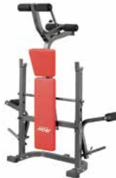
Folds for storage