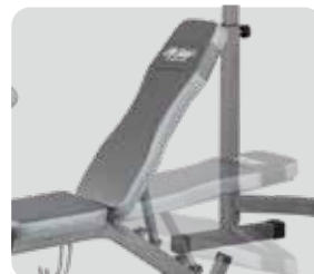
( 5-Level Incline of Back Pad )