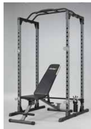
The Weight Bench Can Be Combined With Power Rack (Not Included) & Barbell (Not Included) To Including The Big 6 Exercise In Your Routine Training With Extra Safety, Such As: Bench Press, Deadlift, Barbell Row, Barbell Squat, Shoulder Press And Etc.