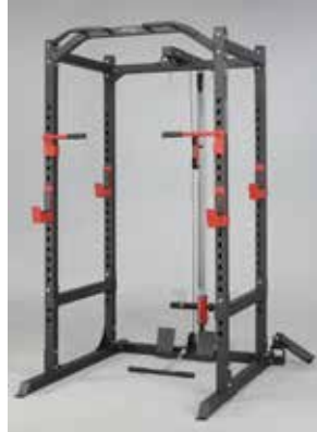
The Lat Pulldown / Low Row Attachment Is An Attachment For Power Cage #78220 (Not Included) That Allows You To Workouts Such As Lat Pulldowns, Tricep Pushdowns, Low Rows, And Overhead Cable Curls