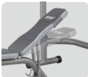
( 4-Level Incline of Back Pad )