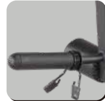
Olympic Adapter Sleeve Allows You To Use Olympic Plates