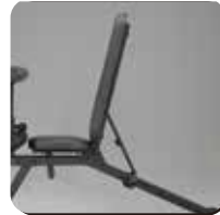
6 Adjustable Backrest Angles