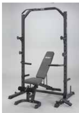
The Weight Bench Can Be Combined With Power Rack (Not Included) & Barbell (Not Included) To Including The Big 6 Exercise In Your Routine Training With Extra Safety, Such As: Bench Press, Deadlift, Barbell Row, Barbell Squat, Shoulder Press And Etc.