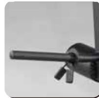
Standard Plate Post with Spring Collar