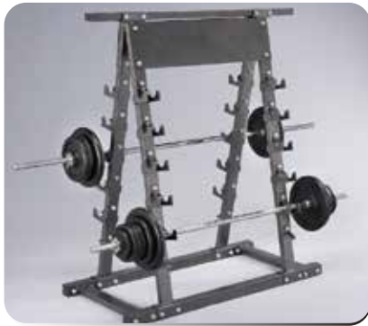
(Easy Access and Storage of Barbells)