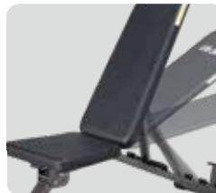
Adjustable Backrest Can Be Adjusted to Incline, Flat And Decline Positions.