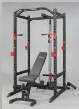
The Power Rack Can Be Combined With Body Bench (Not Included) & Barbell (Not Included) To Including The Big 6 Exercise In Your Routine Training With Extra Safety, Such As: Bench Press, Deadlift, Barbell Row, Barbell Squat, Shoulder Press And Etc.