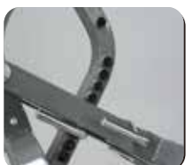
The Height Of The Press / Squat Arms Can Be Adjusted By Removing The Position Setting Pin (Arm Height Adjustment).