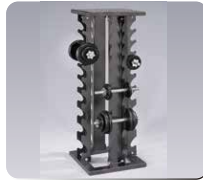
(Easy Access and Storage of Dumbbells)