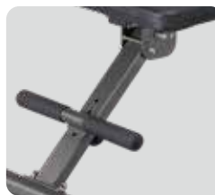
Leg Hold Down Bar Can Be Adjusted To 4 Positions.