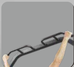
Multi-Position Over Head Chin Up/Pull Up Grip Bars For Building Your Arm, Shoulder And Back Muscle Groups With Variety Of Exercises.