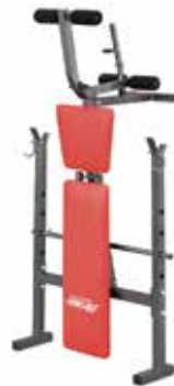
Folds for storage