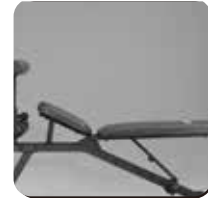
5 Adjustable Seat Heights